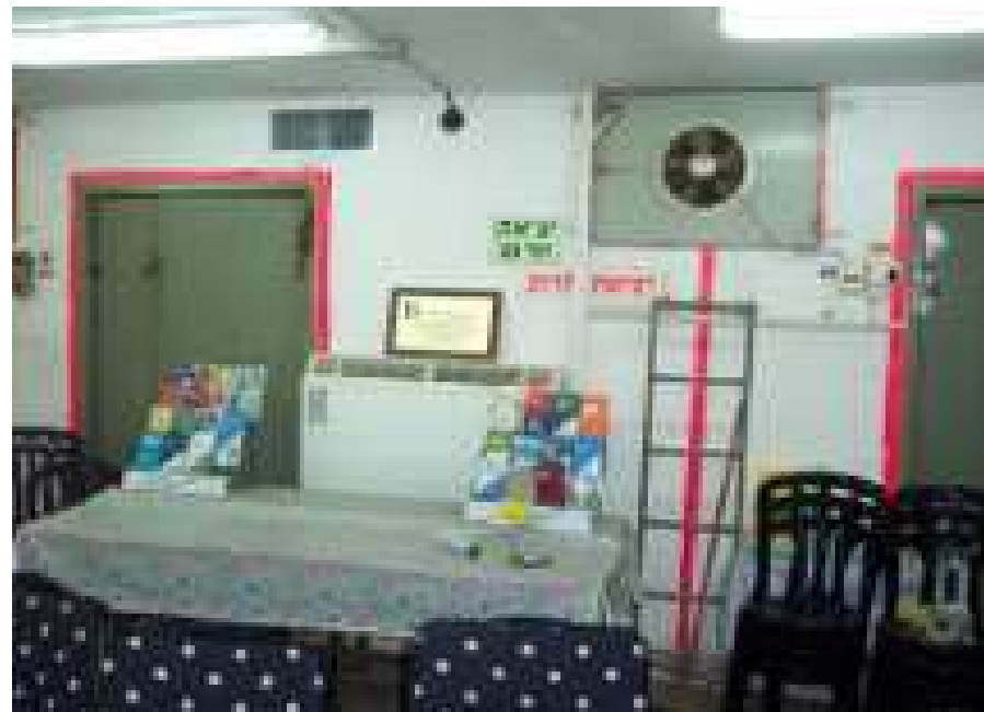
The inside of a Tel Aviv bomb shelter where a local Alcoholic Anonymous member attended a meeting.

About a half-hour later (I did not know how far it was from the